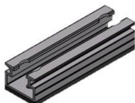
MSP-TT-CHV 100 mm