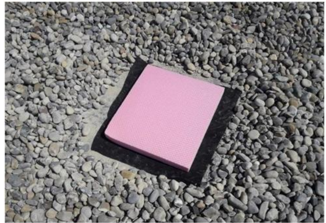
Figure 4: Insertion of the intermediate layer of XPS, underlaid with a protective layer of fleece (if necessary)