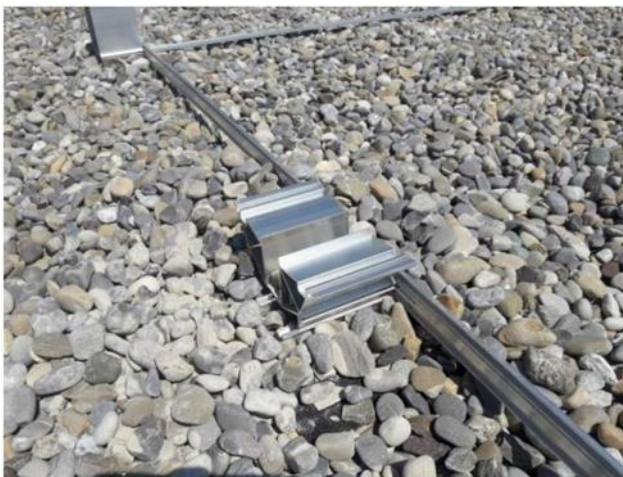
Figure 7: Support with mounted connecting rail