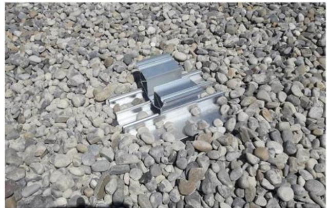
Figure 6: Shallow covering of the intermediate layer with gravel