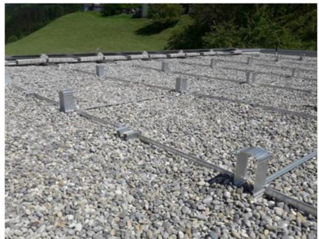
8: MSP-FR mounting system completely installed