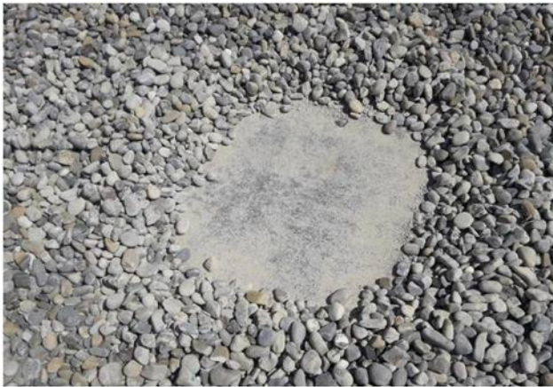
Figure 3: Clear local area of gravel completely