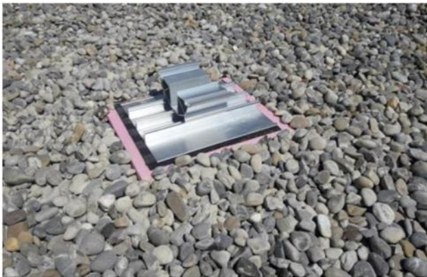
Figure 5: Placement of the base plate with support, fleece under the base plate